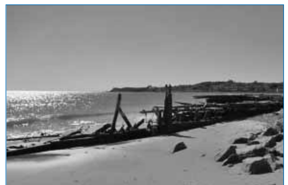
Remnants of 13 barges — partially destroyed by the elements on Cuttyhunk Island.

Allison Thurston has created a compelling new exhibit, SHIFTING SANDS, RISING SEAS — BARGES BEACH , a photographic comparison of changing conditions on this Cuttyhunk barrier beach. It includes a narrative about current challenges and possible solutions. With the inventive use, 50 years