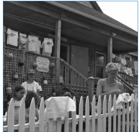
The popular fish print workshop on the Museum lawn, with t-shirts hanging on the porch and fence, summer 2010. The workshop will be repeated this summer.