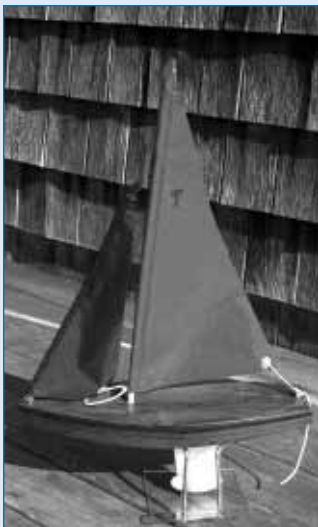
The regatta boat model from the kit.

Two classes of boats—all must be 12" in length